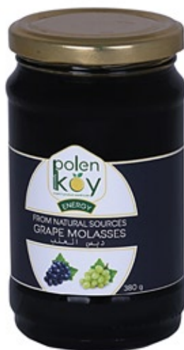
Grape Molasses 380 gr. Product Code : 111053