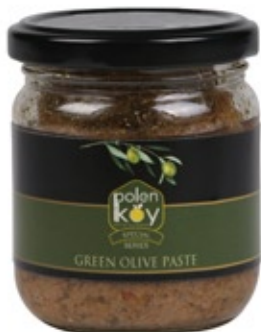
Green Olive Paste 175 gr. Product Code : 111216