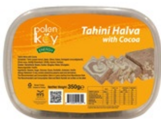
Tahini Halva with Cocoa 350 gr. Product Code : 111235

Halva, which is a must-have of every breakfast table, stands out with its satiating, nutritious and energizing properties. It's made out of sesame what makes this natural product very valuable for human health.