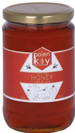
Linden Tree Honey 850 gr. Product Code : 111081