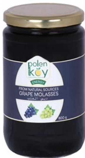
Grape Molasses 800 gr. Product Code : 111054