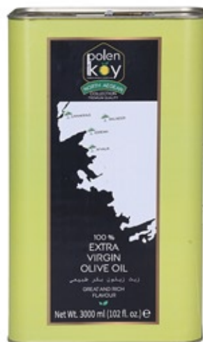
Extra Virgin Olive Oil 3000 ML Product Code : 111133