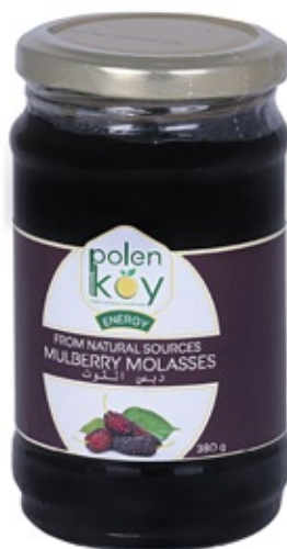
Mulberry Molasses 380 gr. Product Code : 111055