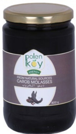
Carob Molasses 800 gr. Product Code : 111052