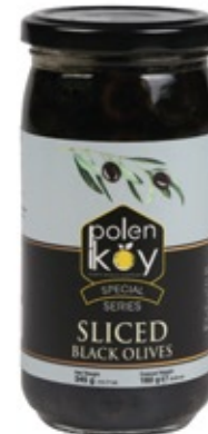
Sliced Black Olives 160 gr. Product Code : 111218