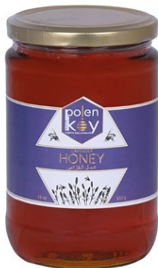
Lavender Honey 850 gr. Product Code : 111077