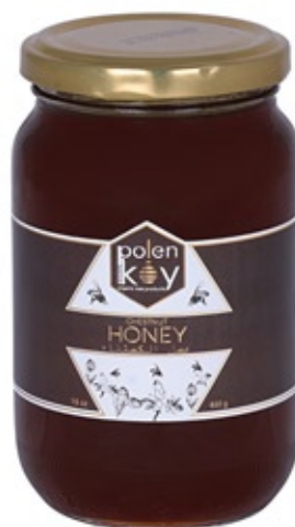
Chestnut Honey 460 gr. Product Code : 111084