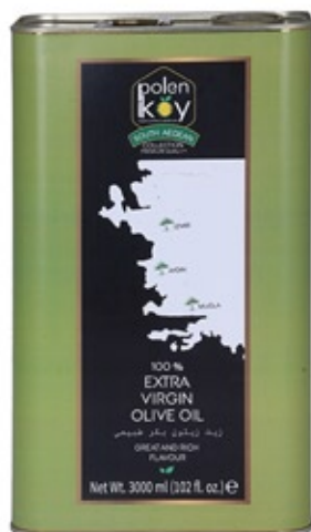
Extra Virgin Olive Oil 3000 ML Product Code : 111137