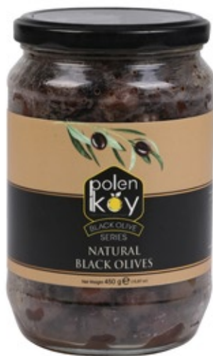
Natural Black Olives 450 gr. Product Code : 111210