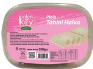
Plain Tahini Halva 350 gr. Product Code : 111231

Halva, which is a must-have of every breakfast table, stands out with its satiating, nutritious and energizing properties. It's made out of sesame what makes this natural product very valuable for human health.