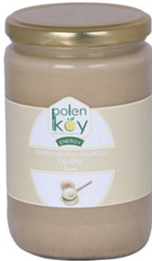
Tahini 610 gr. Product Code : 111062