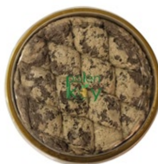
Tahini Halva with Cocoa (Copper Tray) 350 gr. Product Code : 111237