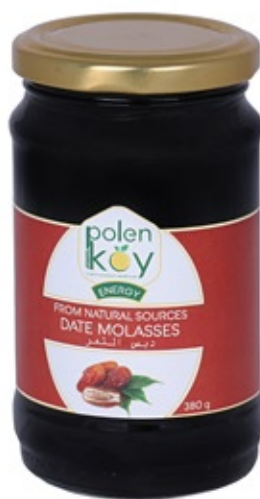
Date Molasses 380 gr. Product Code : 111059