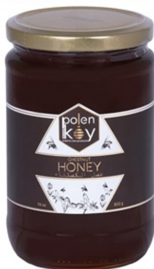
Chestnut Honey 850 gr. Product Code : 111085