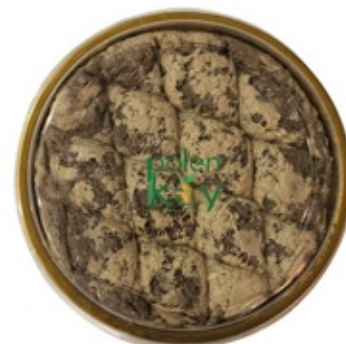
Tahini Halva with Cocoa (Copper Tray) 700 gr. Product Code : 111238