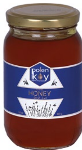
Thyme Honey 460 gr. Product Code : 111082