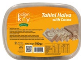
Tahini Halva with Cocoa 700 gr. Product Code : 111236