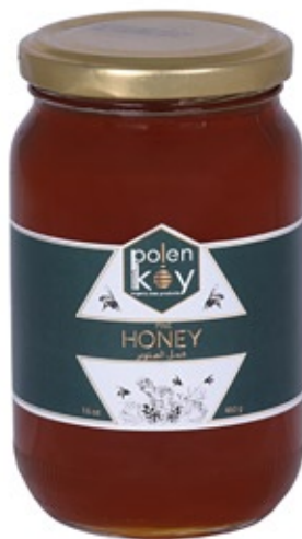
Pine Honey 460 gr. Product Code : 111074