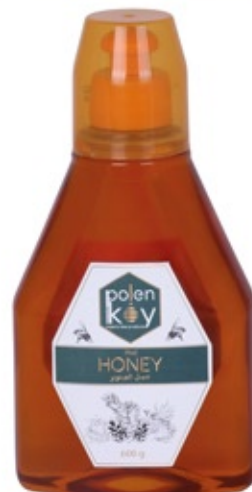
Pine Honey PET 600 gr. Product Code : 111090