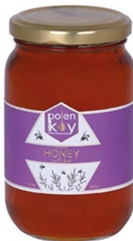
Acacia Honey 460 gr. Product Code : 111078