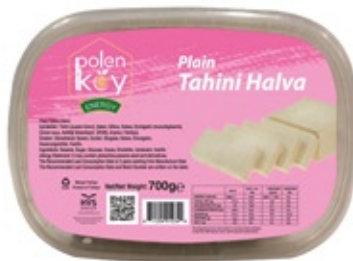
Plain Tahini Halva 700 gr. Product Code : 111232