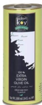
Extra Virgin Olive Oil 1000 ML Product Code : 111131