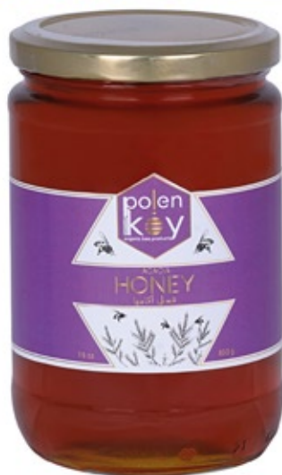
Acacia Honey 850 gr. Product Code : 111079