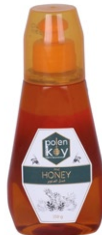
Pine Honey PET 350 gr. Product Code : 111089