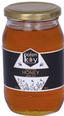
Multi Flower Honey 460 gr. Product Code : 111072