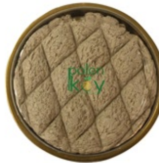
Plain Tahini Halva (Copper Tray) 350 gr. Product Code : 111233