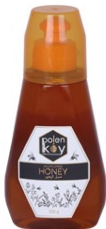
Multi Flower PET 350 gr. Product Code : 111087