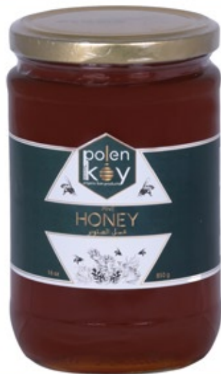
Pine Honey 850 gr. Product Code : 111075