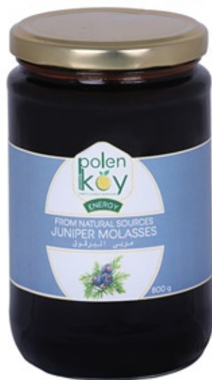
Juniper Molasses 800 gr. Product Code : 111058