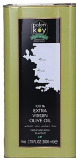
Extra Virgin Olive Oil 5000 ML Product Code : 111138