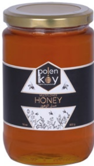
Multi Flower Honey 850 gr. Product Code : 111073