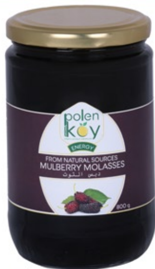
Mulberry Molasses 800 gr. Product Code : 111056