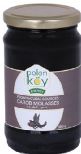
Carob Molasses 380 gr. Product Code : 111051