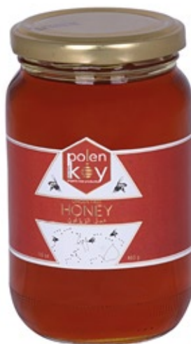
Linden Tree Honey 460 gr. Product Code : 111080