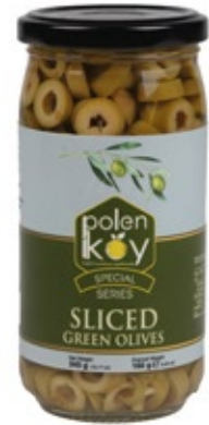
Sliced Green Olives 160 gr. Product Code : 111219