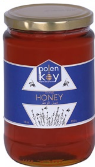
Thyme Honey 850 gr. Product Code : 111083