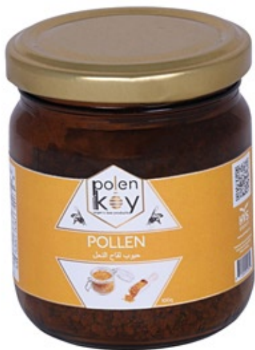
Pollen 100 gr. Product Code : 111086