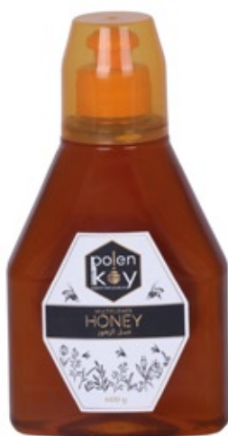
Multi Flower PET 600 gr. Product Code : 111088