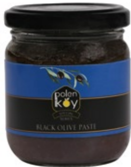
Black Olive Paste 175 gr. Product Code : 111215

Our Green, Black and Mix Special Series give you the choice of a variety of delicious olive products, which are: black, green, stuffed, pitted, or sliced olives, as well as olive paste.