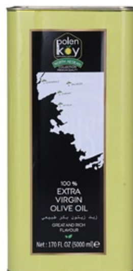
Extra Virgin Olive Oil 5000 ML Product Code : 111134