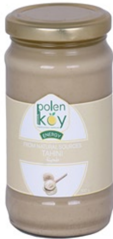
Tahini 300 gr. Product Code : 111061