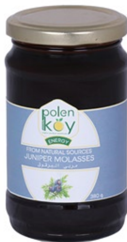
Juniper Molasses 380 gr. Product Code : 111057