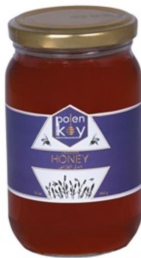
Lavender Honey 460 gr. Product Code : 111076