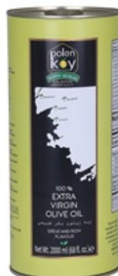
Extra Virgin Olive Oil 2000 ML Product Code : 111132