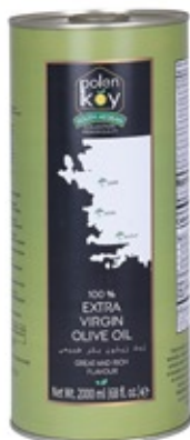
Extra Virgin Olive Oil 2000 ML Product Code : 111136