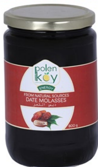
Date Molasses 800 gr. Product Code : 111060