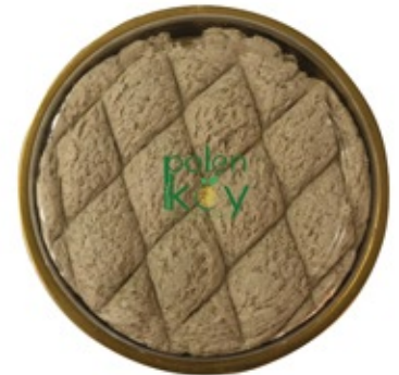
Plain Tahini Halva (Copper Tray) 700 gr. Product Code : 111234