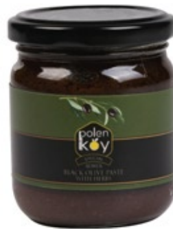
Black Olives Paste With Herbs 175 gr. Product Code : 111217