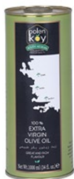
Extra Virgin Olive Oil 1000 ML Product Code : 111135